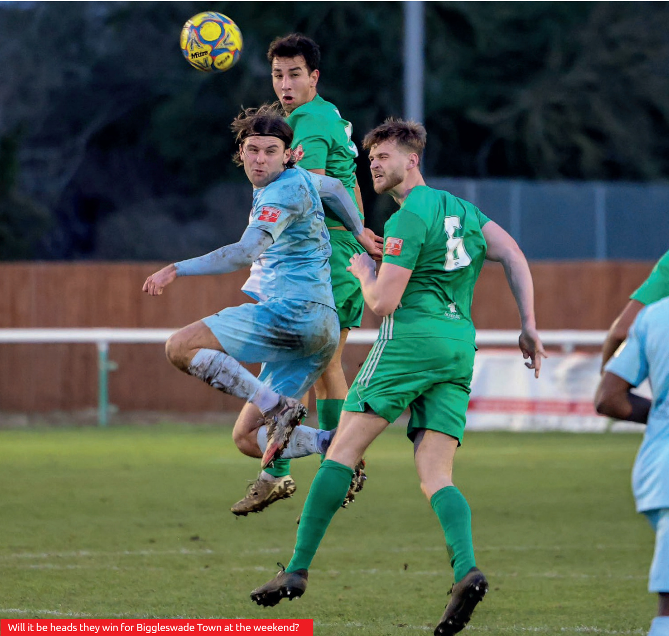
Will it be heads they win for Biggleswade Town at the weekend?

Hot on the heels of leaders, Leighton Town, are Hitchin Town, who will be looking to respond to last weekend's home defeat as they make the trip to Welwyn Garden City.