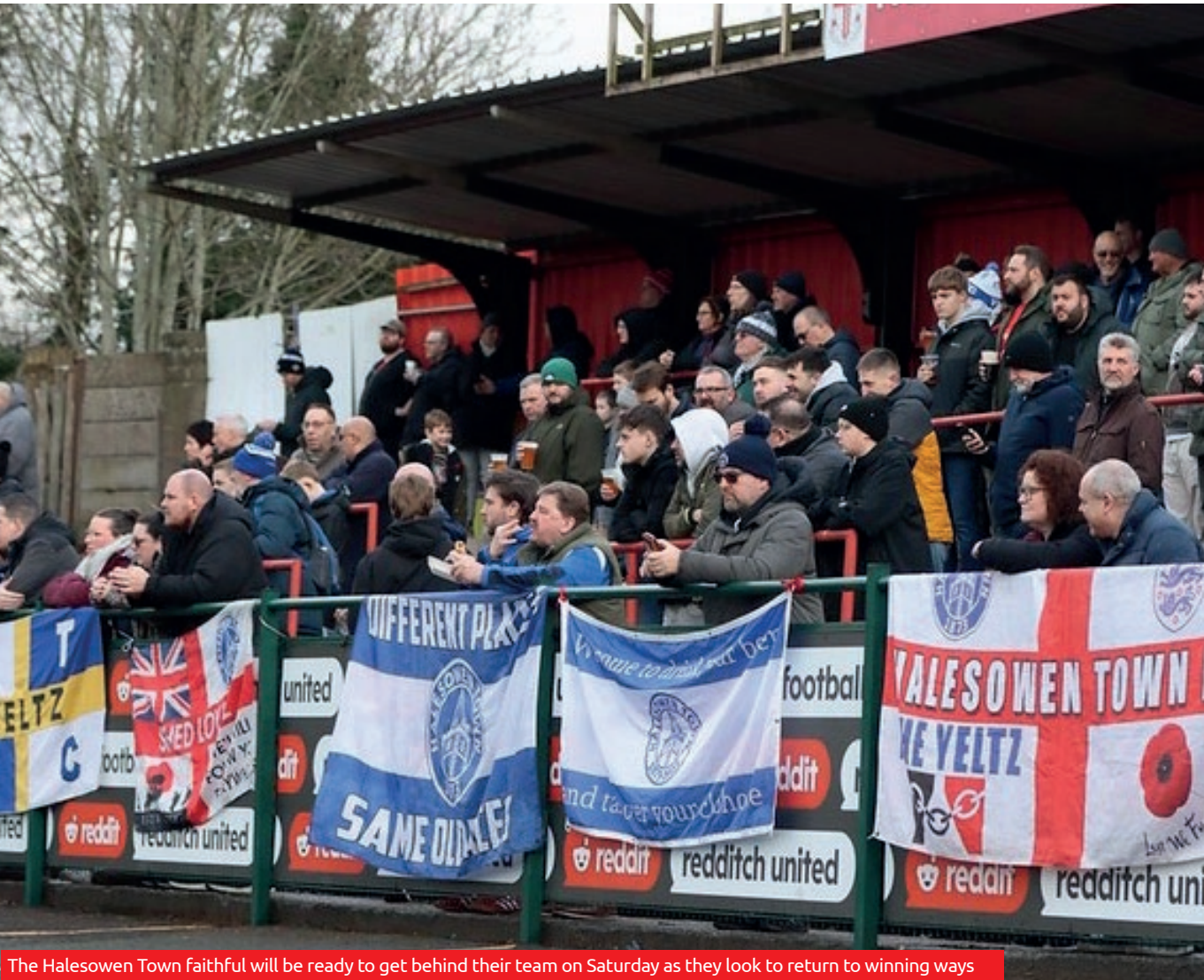
The Halesowen Town faithful will be ready to get behind their team on Saturday as they look to return to winning ways

It's tight at the top as Spalding United hold a one-point advantage over Harborough Town. On Saturday, Spalding hit the road for AFC Sudbury, who are desperate for the points for different reasons. Meanwhile, Harborough Town go to Bromsgrove Sporting, who find themselves too close to the bottom four for comfort. Another top against bottom encounter sees Real Bedford head to Royston Town, who go into the game three points adrift at the foot of the table. Quorn were able to halt a dip in form on Tuesday as they beat Stamford AFC 2-0 and they now go to Bury Town, who have picked up some valuable points recently. Only seven points separate third to 11th so there is plenty of excitement ahead as clubs jostle for position. Halesowen Town host a Banbury United outfit whose recent form has thrust them