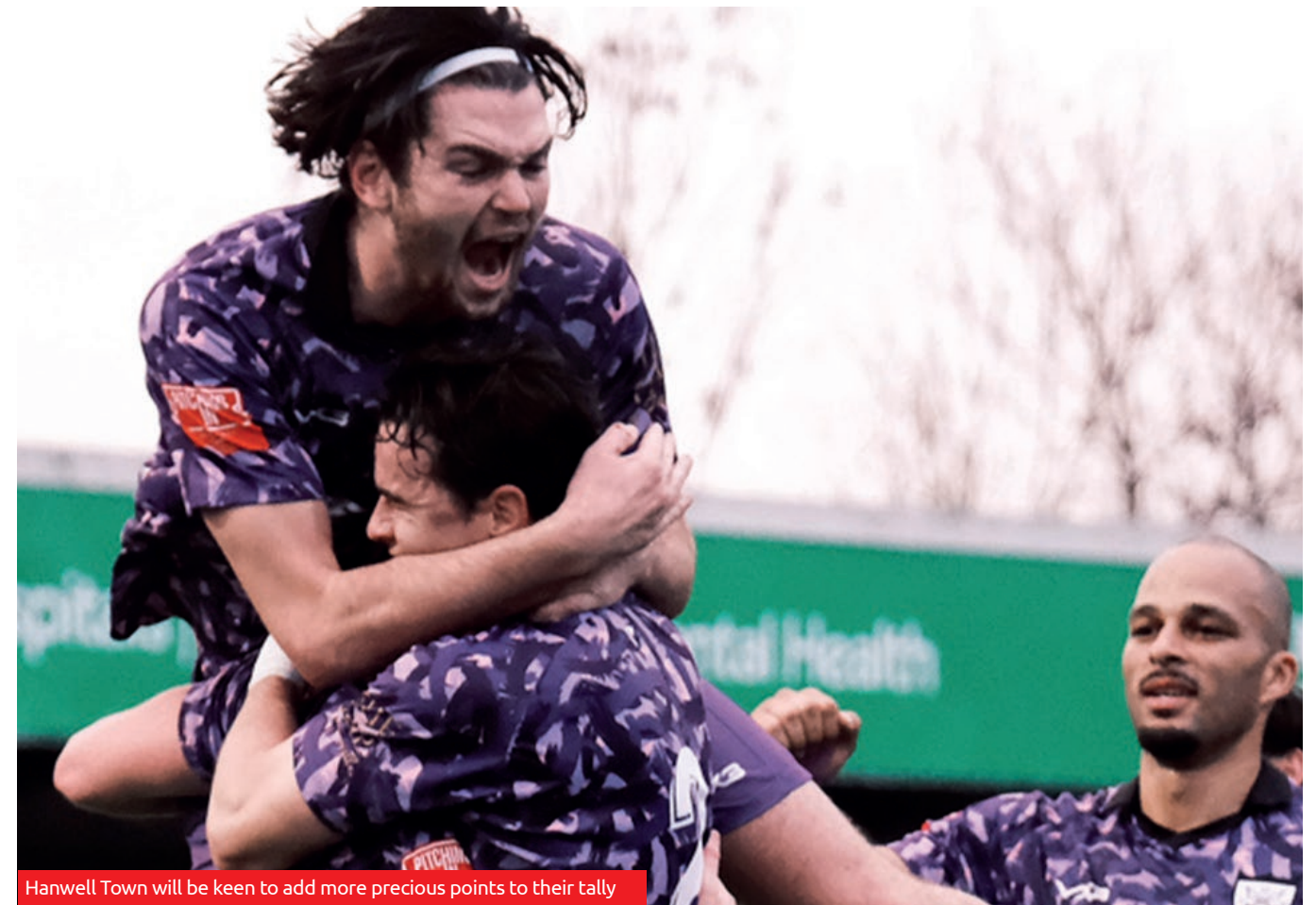
Hanwell Town will be keen to add more precious points to their tally

At the top of the table, Walton & Hersham return to League action as their Isuzu FA Trophy adventure came to an end last Saturday. They face a home encounter with a Bracknell Town side whose recent impressive form was halted last weekend when they went down by two goals to nil at home to Plymouth Parkway.