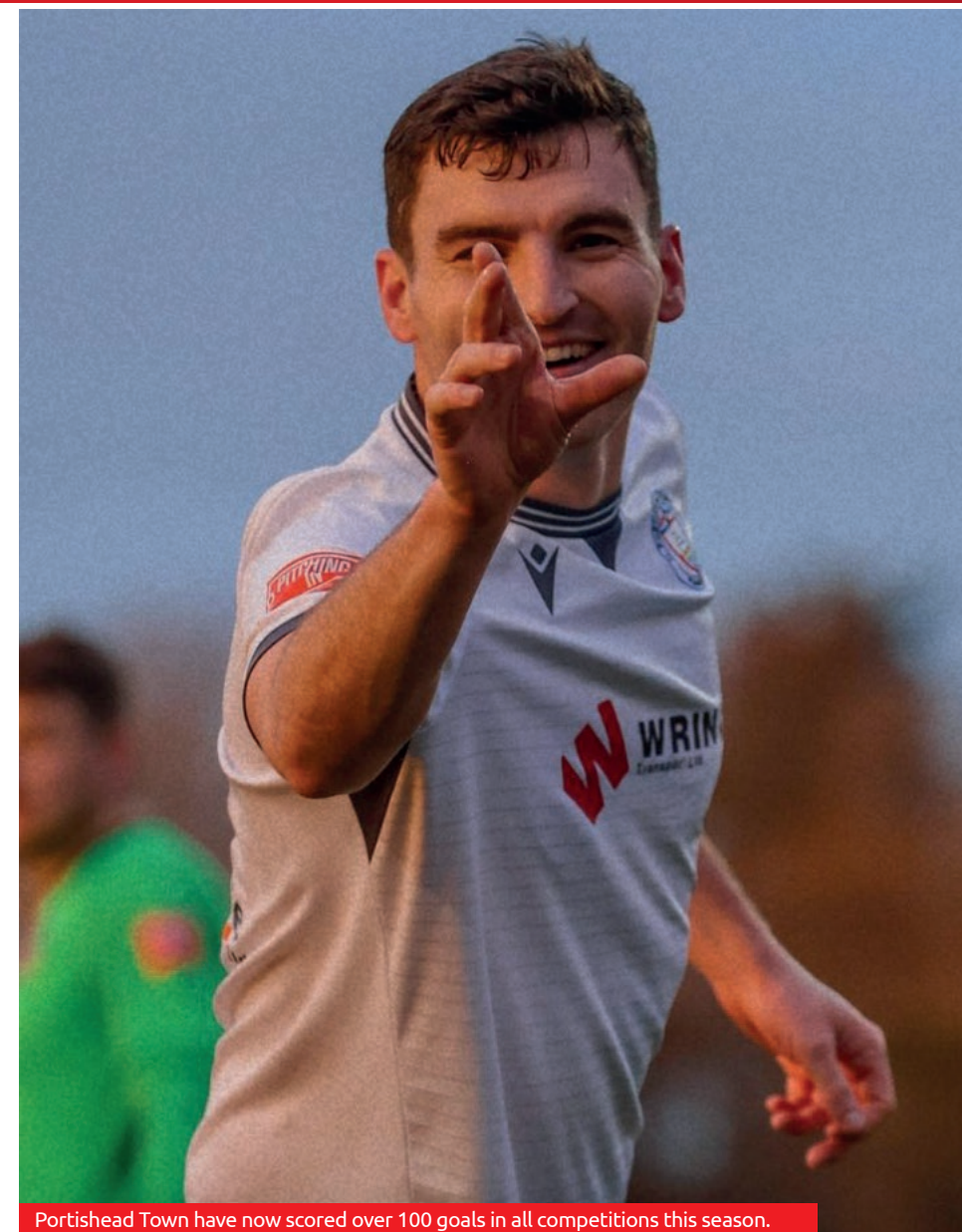
Portishead Town have now scored over 100 goals in all competitions this season.

Elsewhere, Bristol Manor Farm and Swindon Supermarine are locked together on 26 points and they meet at the weekend, whilst Sporting Club Inkberrow welcome Bideford AFC. Finally, Westbury United will be looking to close the five-point gap on Exmouth Town as they face each other on Saturday in what is sure to be another action-packed day.